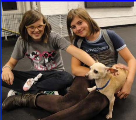
Meeting shelter animals

To foster compassion and respect toward other people, animals and the environment by educating youth and teachers in humane education.