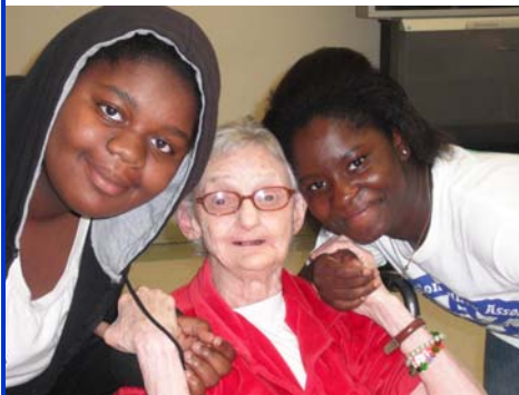
Volunteering at a nursing home