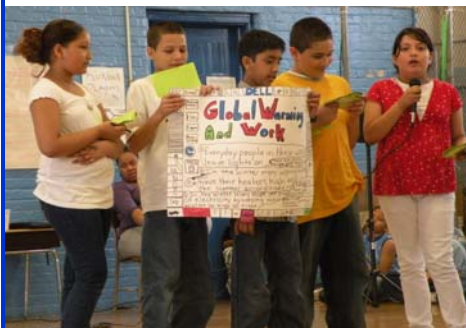
Global warming project